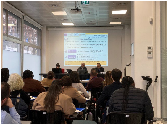
Students at the National Institute for the Evaluation of Education and Training

The <u>University of Maryland School of Public Policy</u> will offer an in-person, for-credit international course on evaluation-based, performance monitoring and management in Rome, Italy during Winter 2025. Classroom instruction will be provided by university instructors and guest faculty—complemented by consultations with officials of the Italian Government, international organizations, and NGOs.