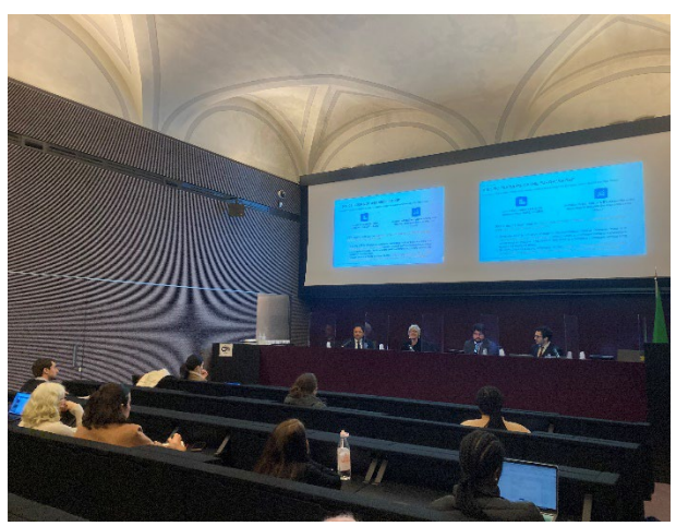
Students at the Ministry of Economy and Finance